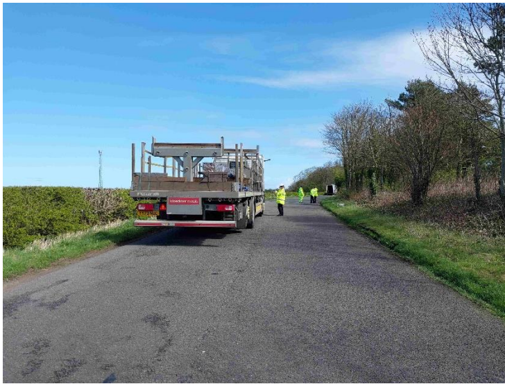
Vehicle checks at Burnmouth

On 17 th April, Roads Policing officers, in partnership with the Community Action Team, Community Policing Team and Motorcycle Unit ran an operation on the A1 at Burnmouth. Our partners from Driver and Vehicle Standards Agency, Traffic Examiners and HM Revenue and Customs were also present. The aim was to carry out numerous checks of vehicles to ensure they are fit for use on the roads and ensure legislation is complied with. 73 vehicles were stopped, 9 offences dealt with, and numerous warnings issued.